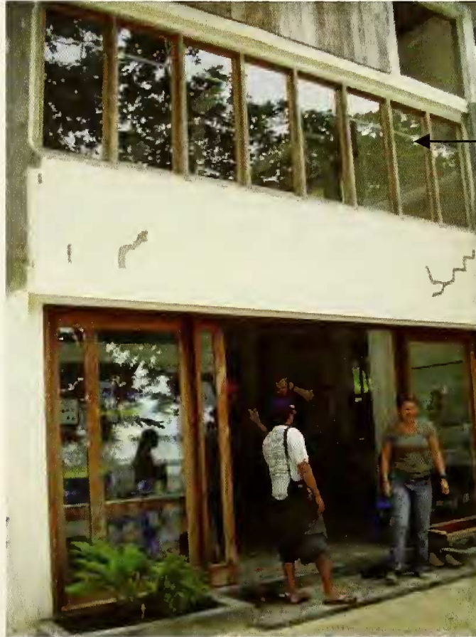
Figure 11. Lumba Lumba dive shop on Pulau Weh; arrow indicates maximum height of wave action (~5 m above sea level) on December 26, 2004.

Pulau Weh (marked by the main town ‘Sabang’ on Fig. 1) lies off the north coast of Aceh Province and is the largest (153 km 2 ) and most populated (population ~28,500) of the northern offshore islands. A visit ashore on the north coast of Pulau Weh confirmed that there had been significant impacts from the tsunami wave on land (Fig. 11).